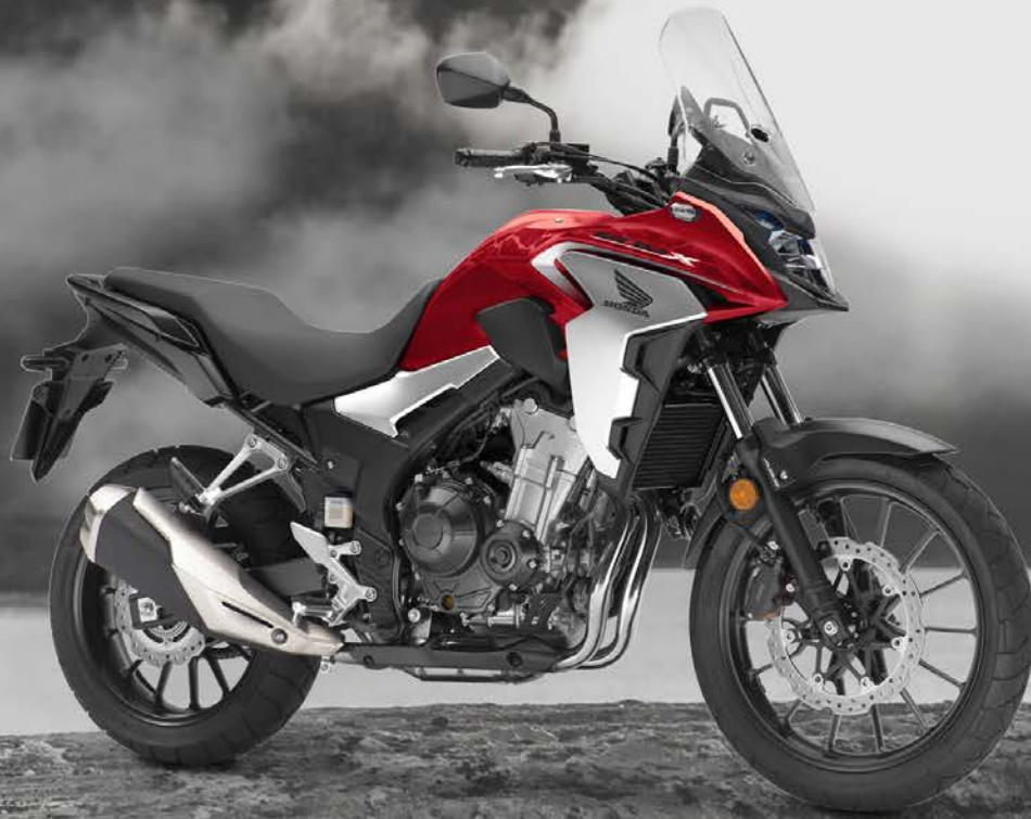
Grand Prix Red