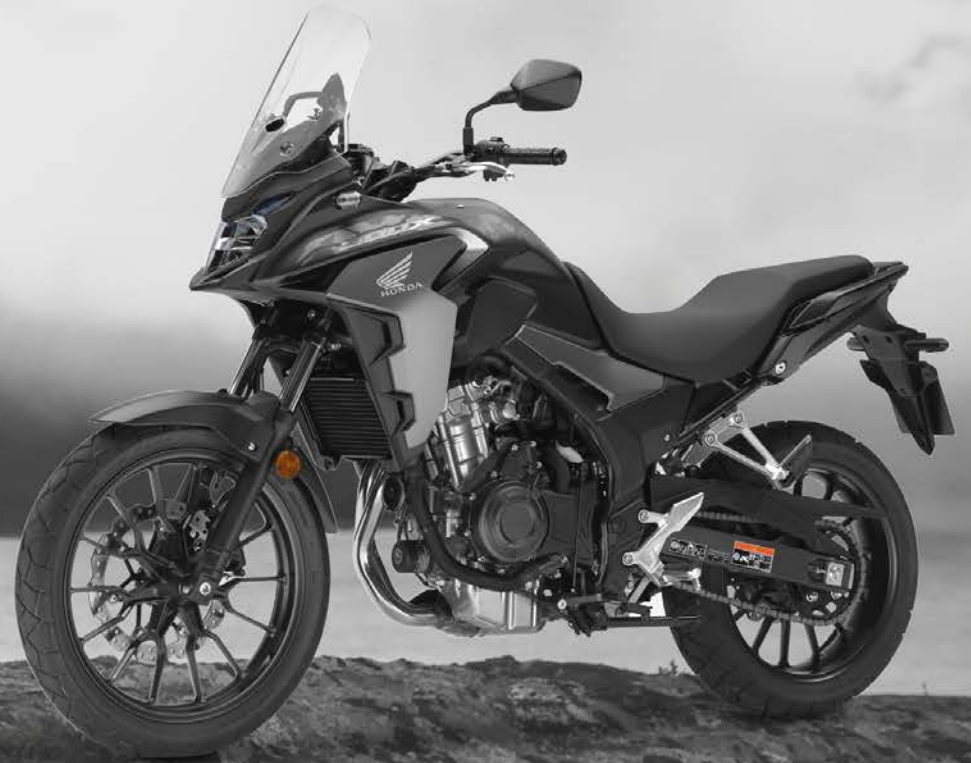
Matt Gunpowder Black Metallic